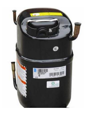
France Tecumseh compressor